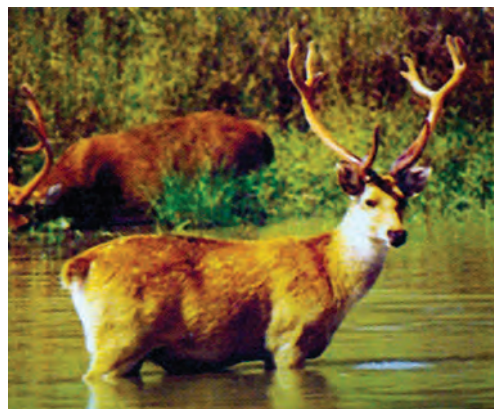
Fig. 5.6 : Barasingha

animals has become difficult because of disturbances in their natural habitat. Professor Ahmad tells them that in order to protect plants and animals strict rules are imposed in all National Parks. Human activities such as grazing, poaching, hunting, capturing of animals or collection of firewood, medicinal plants, etc. are not allowed