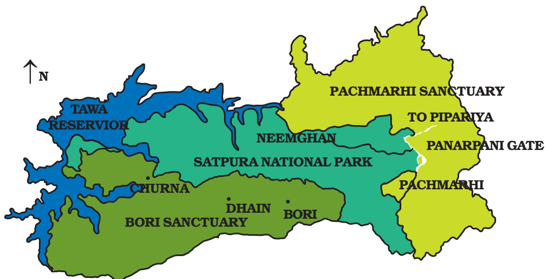
Fig. 5.1 : Pachmarhi Biosphere Reserve