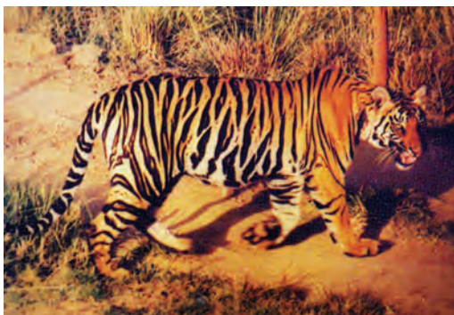
Fig. 5.4 : Tiger

Tiger (Fig. 5.4) is one of the many species which are slowly disappearing from our forests. But, the Satpura Tiger Reserve is unique in the sense that a significant increase in the population of tigers has been seen here. Once upon a time, animals like lions, elephants, wild