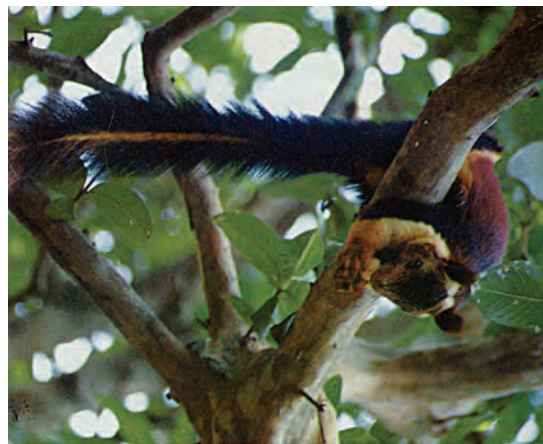
Fig. 5.3 (b) : Giant squirrel

endemic flora of the Pachmarhi Biosphere Reserve. Bison, Indian giant squirrel [Fig. 5.3 (b)] and flying squirrel are endemic fauna of this area. Professor Ahmad explains that the destruction of their habitat, increasing population and introduction of new species may affect the natural habitat of endemic species and endanger their existence.