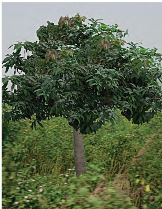
Fig. 5.3 (a) : Wild Mango

Madhavji shows sal and wild mango (Fig. 5.3 (a)) as two examples of the