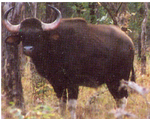
Fig. 5.5 : Wild buffalo

buffaloes (Fig. 5.5) and barasingha (Fig. 5.6) were also found in the Satpura National Park. Animals whose numbers are diminishing to a level that they might face extinction are known as the endangered animals . Boojho is reminded of the dinosaurs which became extinct a long time ago. Survival of some